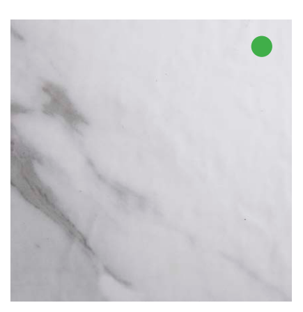
Jura Carrera Marble