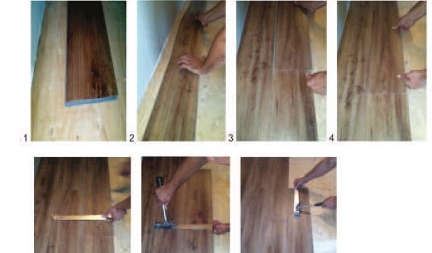
Diagram -3 - Begin the second row with the cutoff end to start the next and subsequent rows. Allow at least a 15cm stagger for end seams. For

positioning the sections together, starting with the first tile in the row, raise the tile at a 45° degree angle, insert the lengthways tongue into the lengthways groove and lower the section while