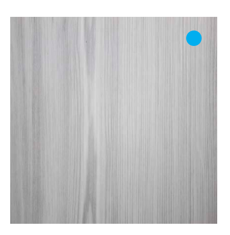
Antique White Oak