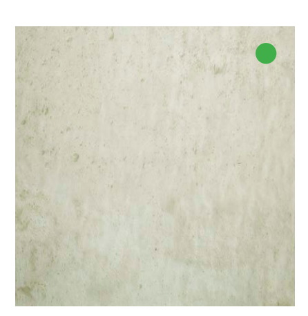
Eriskay Light Concrete